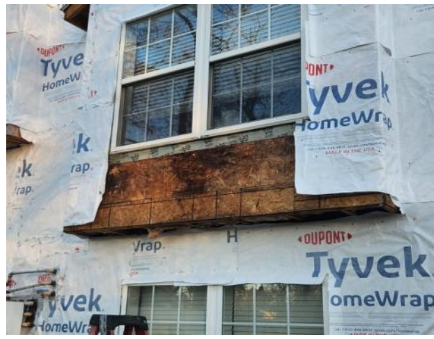
Photo #88: Overview of existing sheathing in poor condition below a box window at Unit 66.