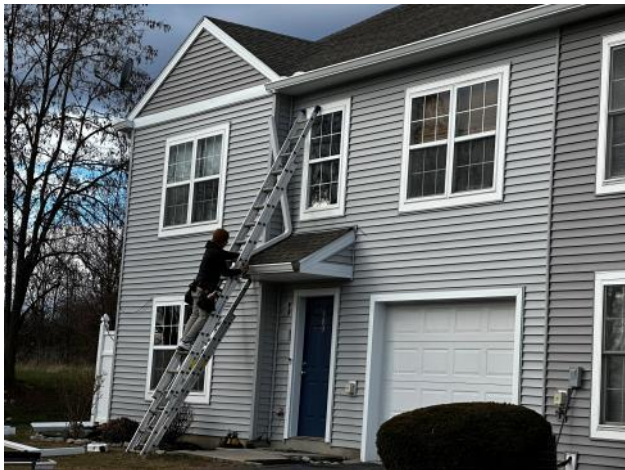
Photo #3: Overview of a new downspout being installed at Building 10.