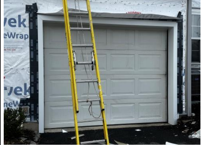
Photo #14: Overview of a garage door being flashed and wall penetrations are being properly flashed with flashing tape.