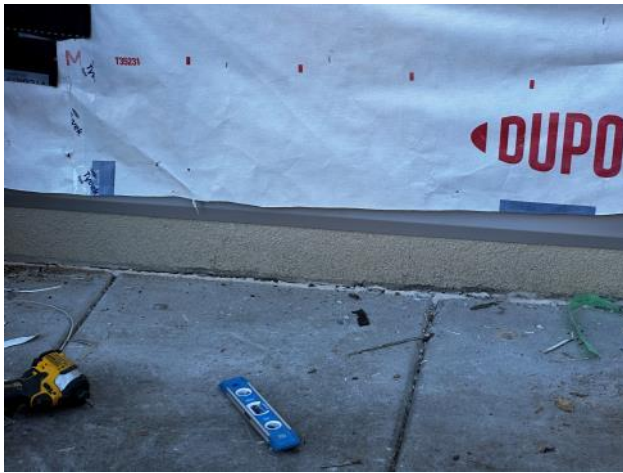
Photo #71: Overview of new metal flashing being installed before installing the starter strip.