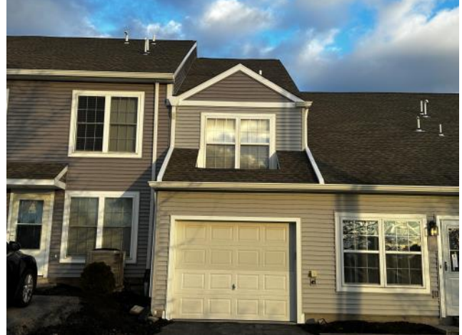
Photo #2: Overview of new gutters and downspouts installed at a front section of Building 9 .