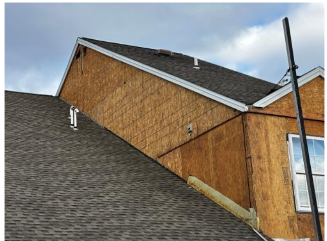
Photo #56: Overview of existing condition of missing leak barrier at the roofing sidewalls.