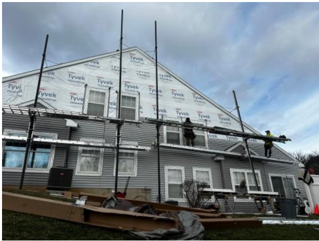
Photo #11: Overview of Lemus Siding Crew (Green) working at Building 14 (61-71 Courtyard Drive).