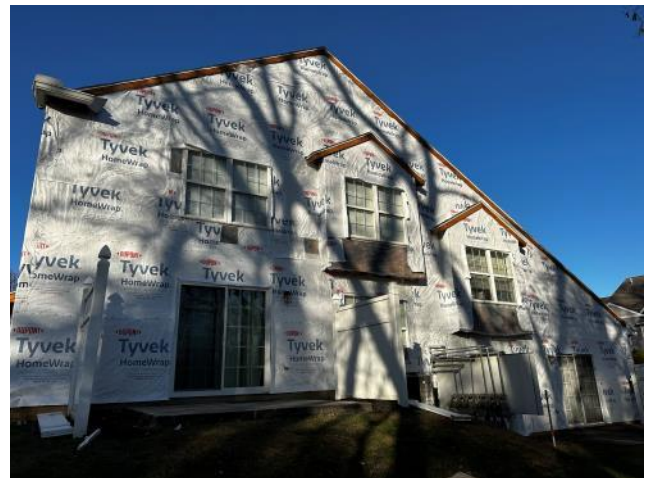
Photo #92: Overview of new Water Resistant Barrier (Tyvek) being installed.