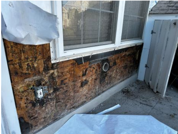
Photo #95: Overview of existing sheathing that was observed in poor condition below a lower window at Unit 45.