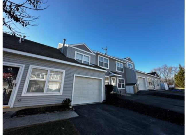
Photo #20: Overview of new vinyl siding installed at a front side of the Building.