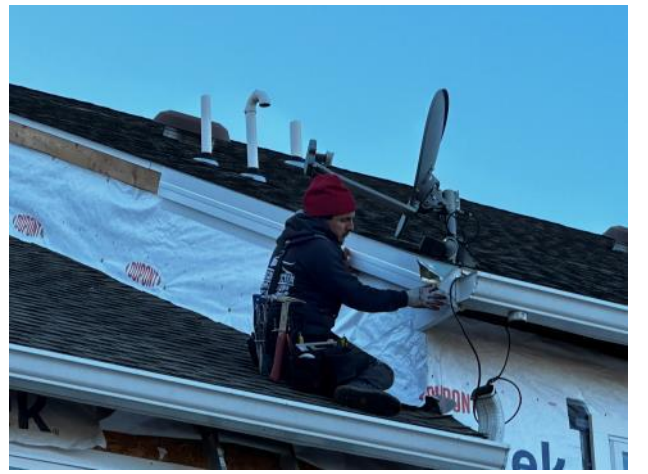
Photo #44: Overview of new metal wrap being installed at a rake board.