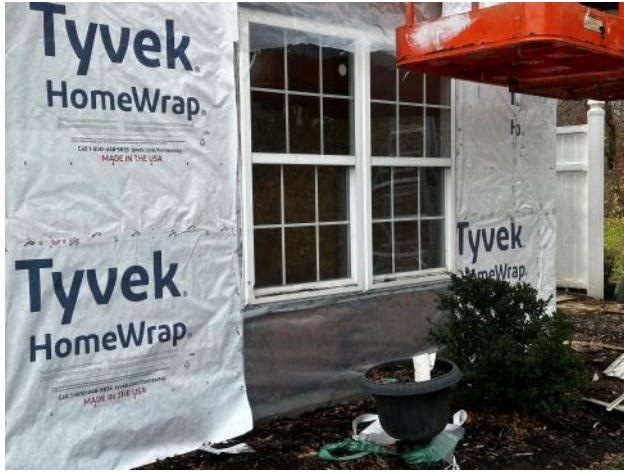
Photo #53: Overview of existing sheathing in poor condition below a lower window at Unit 28.