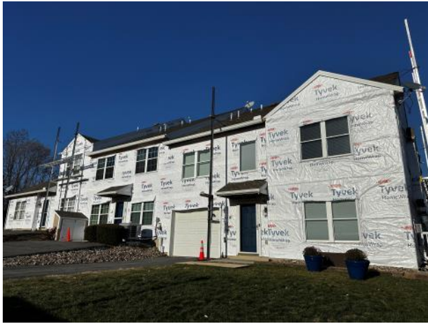
Photo #69: Overview of new Water Resistant Barrier (Tyvek) installed at a front section of the Building.