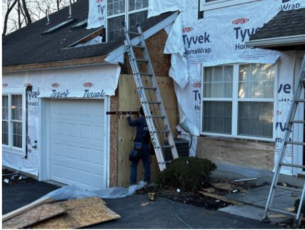
Photo #41: Overview of new sheathing being installed between Units 70 & 72.