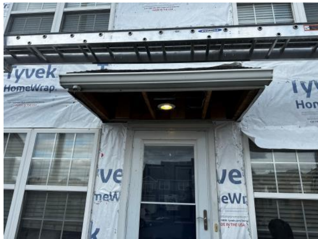
Photo #27: Overview of an entrance roof being reinforced with structural screws in order to eliminate the front brackets.