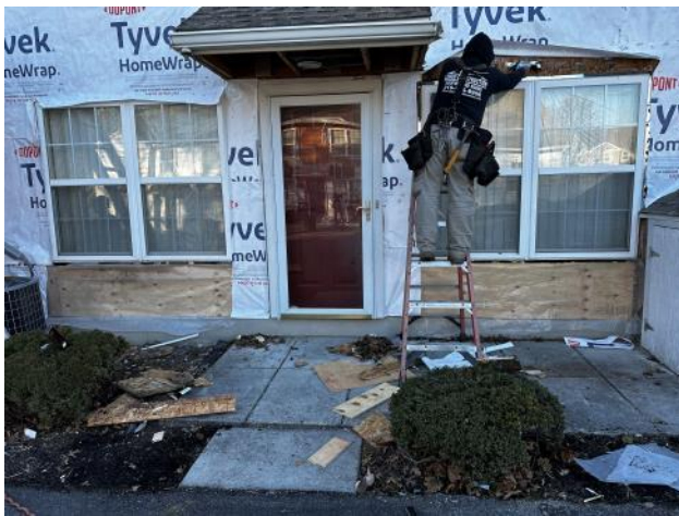
Photo #43: Overview of new sheathing installed below windows at Unit 70.