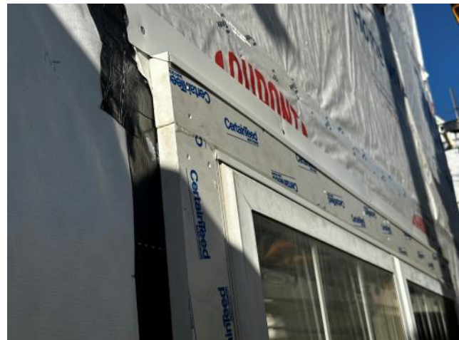
Photo #104: Overview of new metal drip cap and new pvc trim being installed at a window.