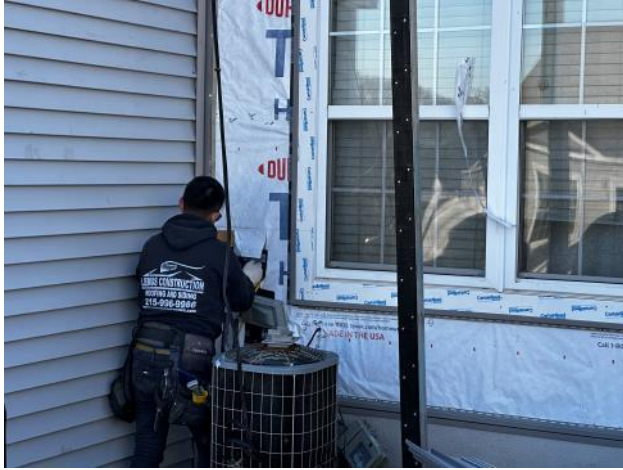
Photo #33: Overview of new flashing tape being installed at a wall penetration.