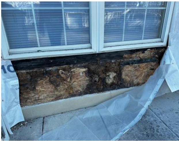
Photo #87: Overview of existing sheathing in poor condition below a lower window at Unit 64.