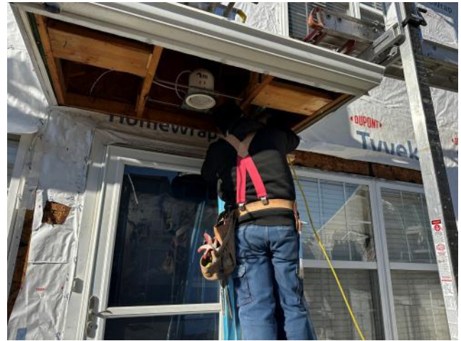
Photo #106: Overview of an entrance roof being reinforced with structural screws in order to eliminate the front brackets.