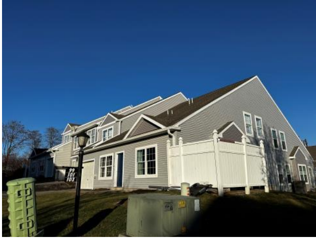
Photo #9: Overview of new gutters and downspouts installed at Building 11 .