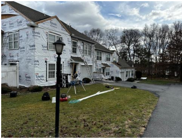
Photo #35: Overview of Lemus Siding Crew (Blue) working at Building 7 (68-78 Courtyard Drive)