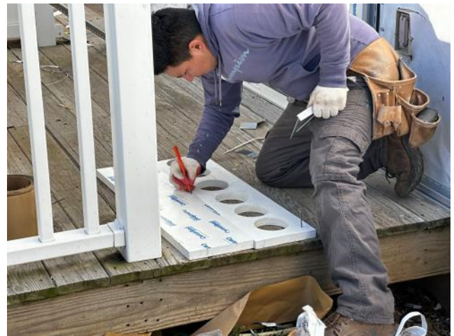
Photo #76: Overview of new pvc mounting block getting ready to be installed at the gas line penetrations.