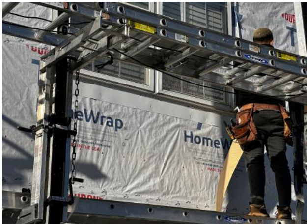
Photo #103: Overview of new metal flashing being installed below a window.