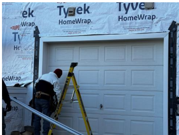
Photo #77: Overview of new aluminum wrap installed at a garage door.