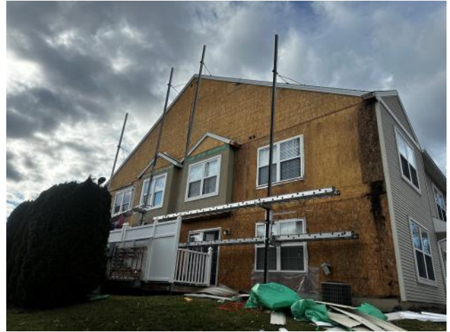
Photo #54: Overview of the existing siding being removed at a main side section of the Building.