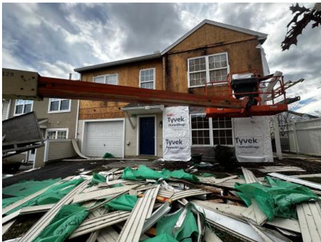
Photo #51: Overview of the existing siding being removed at a front section of the Building.