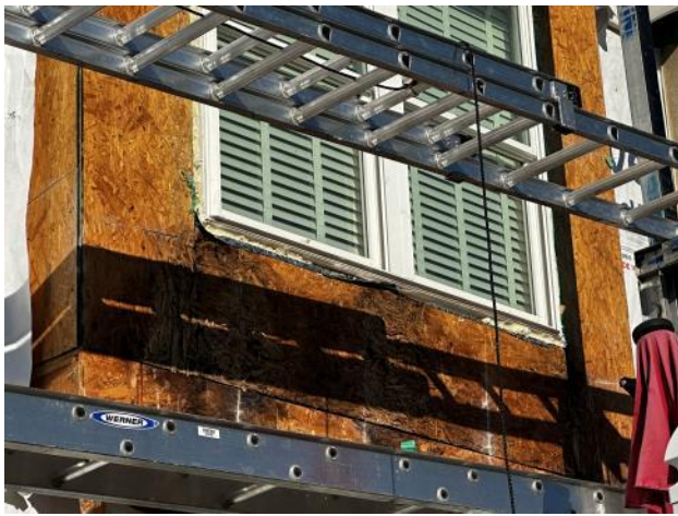
Photo #59: Overview of damaged sheathing below the box window at Unit 55.