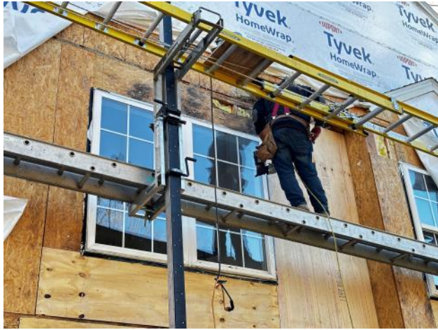
Photo #65: Overview of new sheathing being installed below a window.