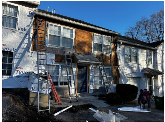
Photo #86: Overview of existing stucco being removed at a front section.