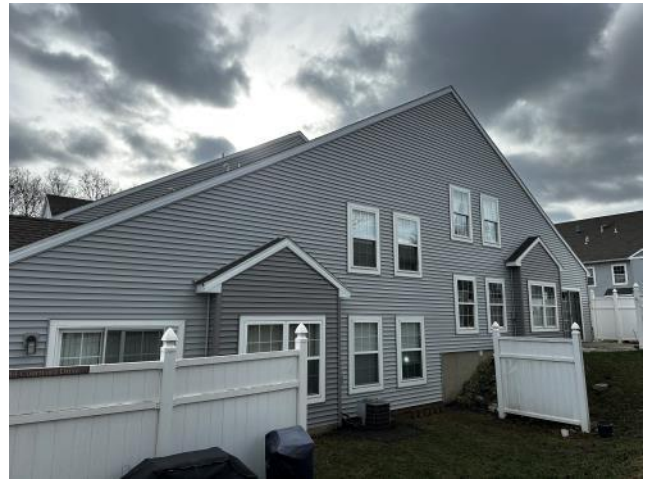
Photo #6: Overview of new vinyl siding and its accessories completed at Building 8.