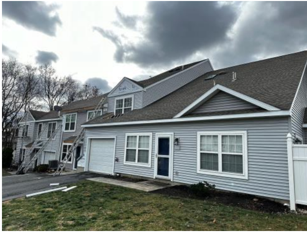
Photo #5: Overview of Lemus Siding Crew (Blue) working at Building 8 (80-90 Courtyard Drive).