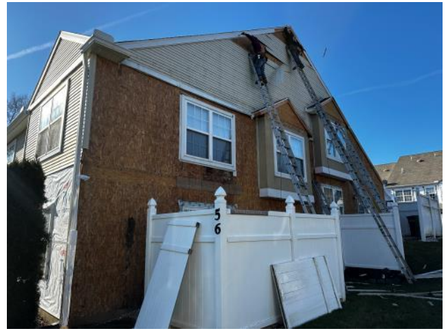
Photo #90: Overview of existing siding being removed at a main side section of the Building.