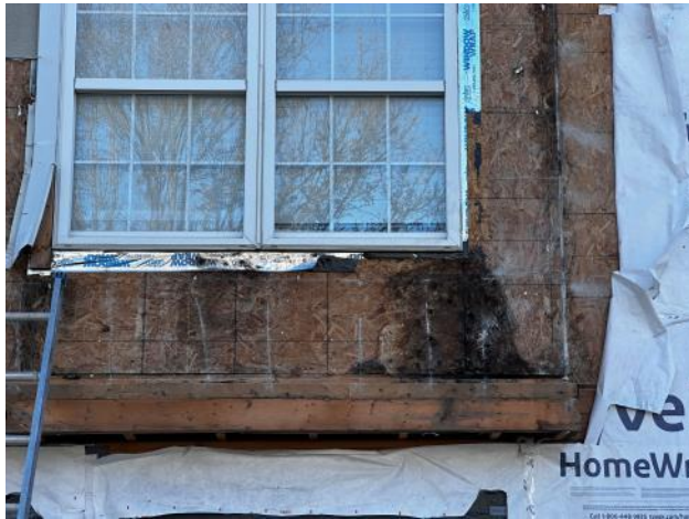
Photo #39: Overview of existing sheathing in poor condition after stucco was removed at the box window of Unit 74.