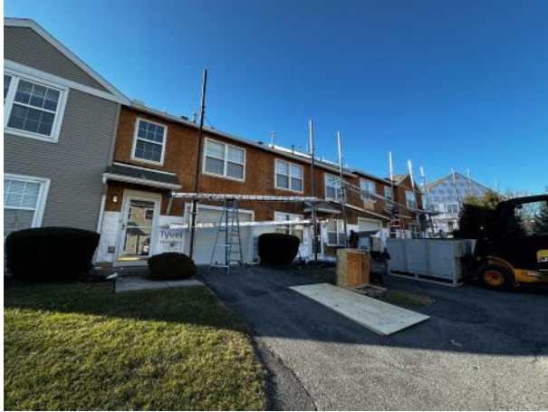
Photo #93: Overview of Lemus Siding Crew (Blue) working at Building 16 (43-53 Courtyard Drive).