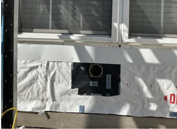
Photo #105: Overview of new flashing tape installed at a wall penetration (bathroom/dryer vent).