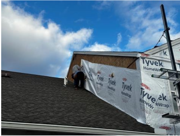
Photo #57: Overview of new Water Resistant Barrier (Tyvek) being installed at a roofing sidewall.