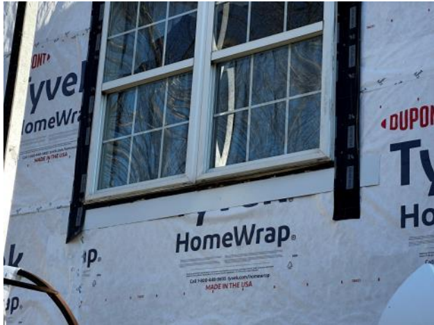
Photo #73: Overview of new metal flashing being installed at the bottom of a window.