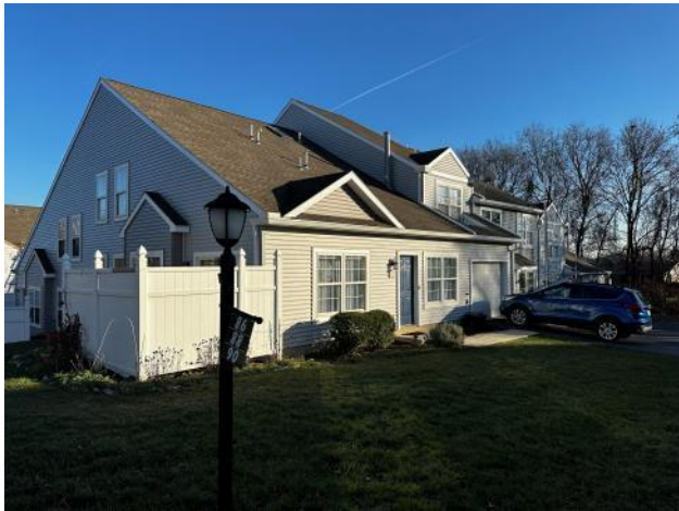
Photo #7: Overview of new gutters and downspouts installed at Building 8 .