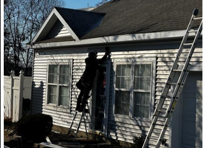
Photo #16: Overview of new vinyl siding being installed at a front section.