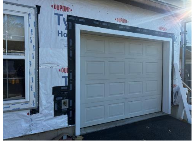
Photo #30: Overview of a garage door being flashed and wall penetrations are being properly flashed with flashing tape.