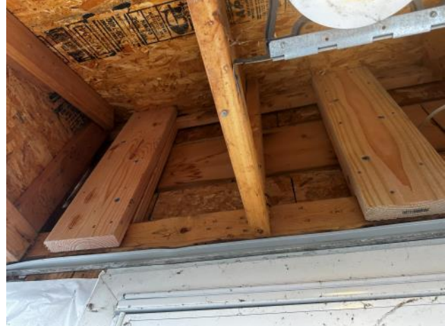
Photo #28: Overview of new structural screws and brackets to reinforced the small entrance roof.