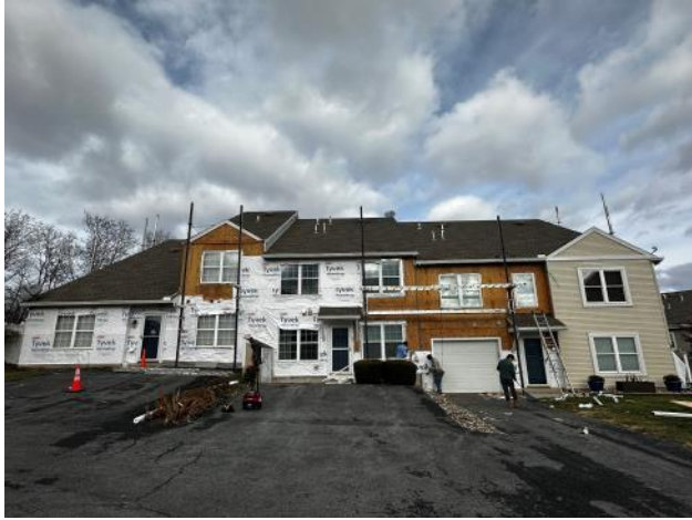
Photo #49: Overview of Lemus Siding Crew (Yellow) working at Building 15 (24-28, 55-59 Courtyard Drive).