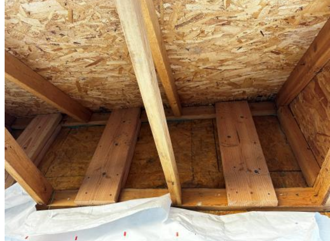
Photo #68: Overview of new structural screws and brackets to reinforced the small entrance roof.