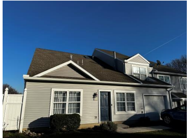
Photo #8: Overview of new gutters and downspouts installed at a front section.