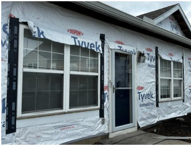
Photo #15: Overview of new metal flashing installed at the bottom of the windows.