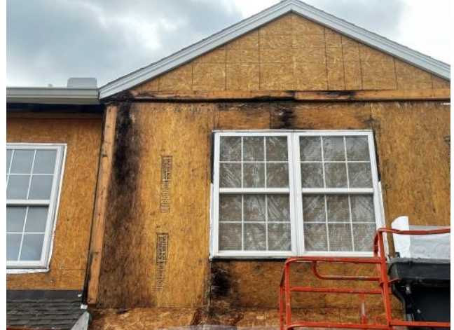
Photo #52: Overview of existing sheathing in poor condition below an upper window and at gable section of Unit 28.