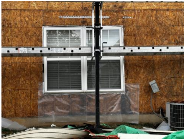
Photo #55: Overview of existing sheathing in poor condition below a lower window at Unit 24.