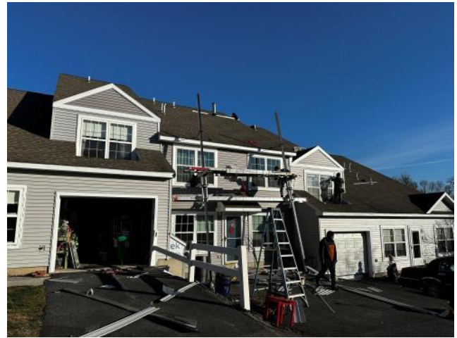
Photo #34: Overview of the siding crew completing the siding installation at Building 12.