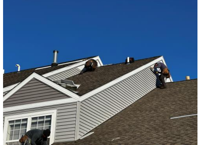
Photo #32: Overview of new vinyl siding being installed at a roofing sidewall.