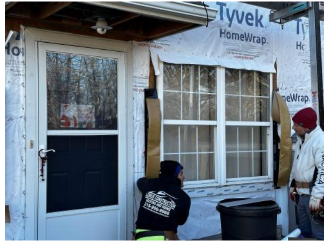
Photo #70: Overview of new flashing tape being installed at a window.