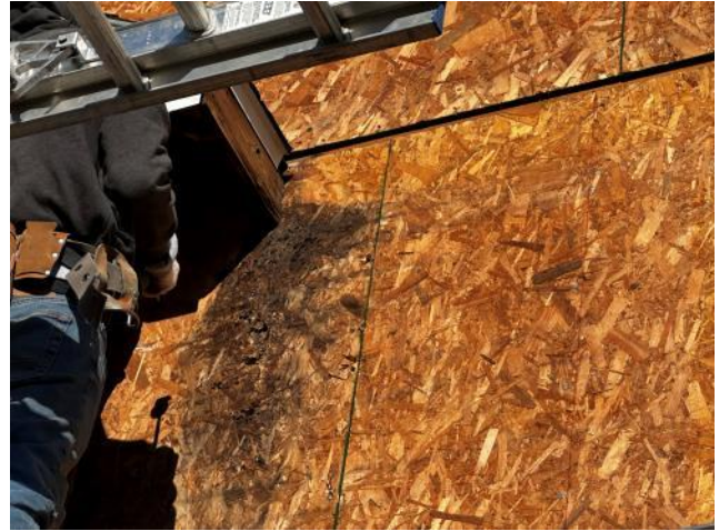
Photo #98: Overview of existing sheathing that was observed in poor condition at section where kick-out flashing is missing.