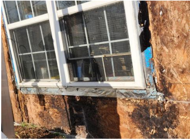
Photo #101: Overview of existing sheathing that was observed in poor condition below a lower window at Unit 47.