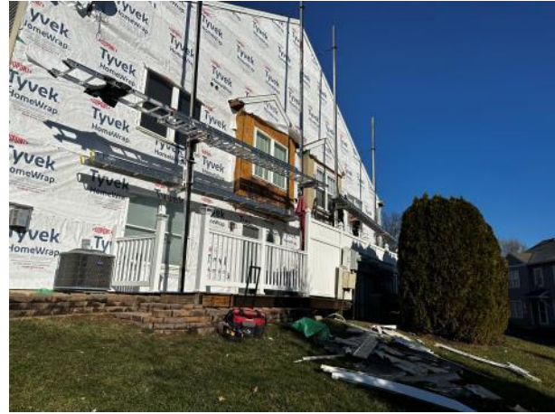
Photo #58: Overview of existing stucco being removed at the box windows of Units 24 & 55.