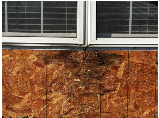
Photo #100: Overview of existing sheathing that was observed in poor condition below a lower window at Unit 43.