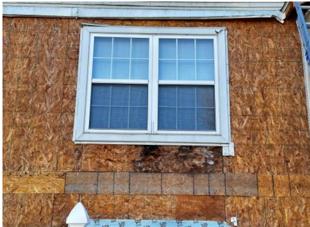
Photo #91: Overview of existing sheathing in poor condition below an upper window at Unit 56.