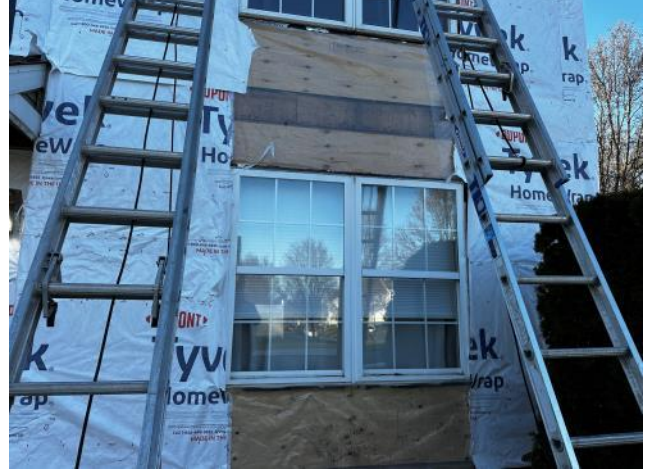
Photo #42: Overview of new sheathing installed below windows at Unit 68.