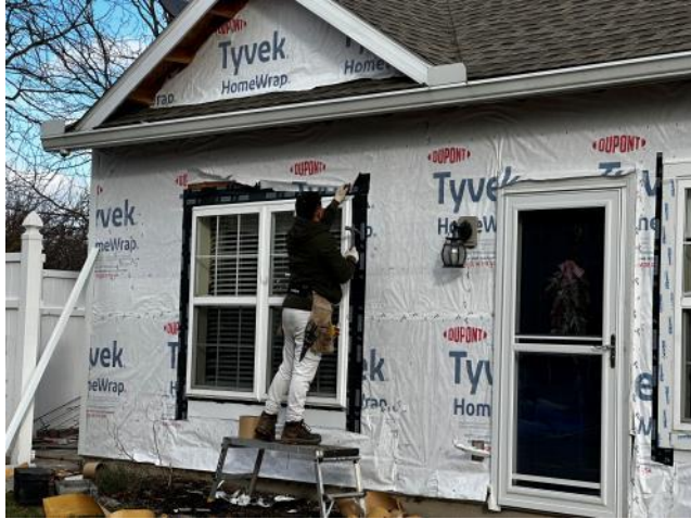
Photo #29: Overview of new flashing tape being installed at a window.