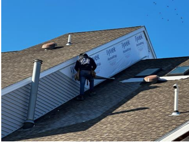
Photo #17: Overview of new vinyl siding being installed at a roofing sidewall section.