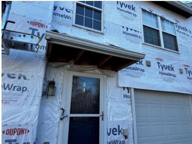
Photo #67: Overview of an entrance roof being reinforced with structural screws in order to eliminate the front brackets.