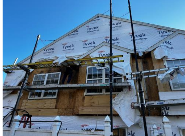
Photo #66: Overview of new sheathing being installed below the box windows.