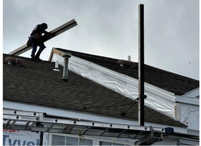
Photo #18: Overview of new aluminum wrap being installed at a rake board.