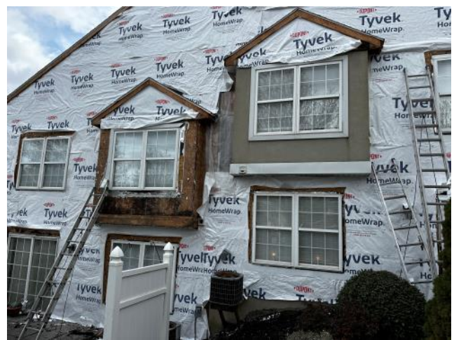
Photo #36: Overview of existing stucco being removed at the box windows of Units 68 & 74.