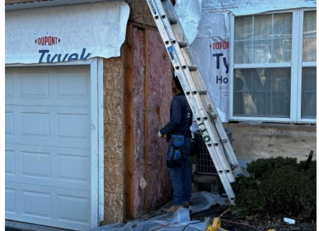
Photo #40: Overview of new insulation being installed between Units 70 & 72.