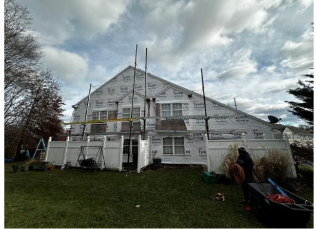
Photo #50: Overview of new Water Resistant Barrier (Tyvek) installed at a main side of the Building.