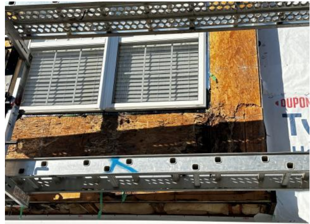
Photo #60: Overview of damaged sheathing below the box window at Unit 24.