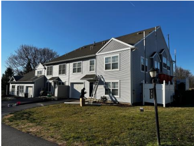
Photo #1: Overview of the gutter crew on-site completing the gutters installation at Buildings 9 & 10.