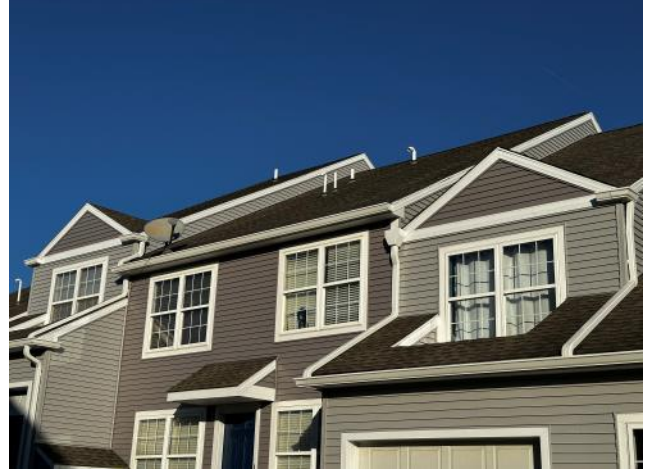
Photo #10: Overview of new gutters and downspouts installed at a front section of Building 11 .