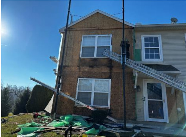
Photo #61: Overview of damaged sheathing below windows at Unit 24.