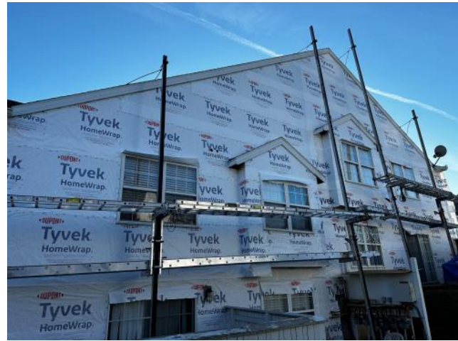
Photo #102: Overview of new Water Resistant Barrier (Tyvek) being installed.