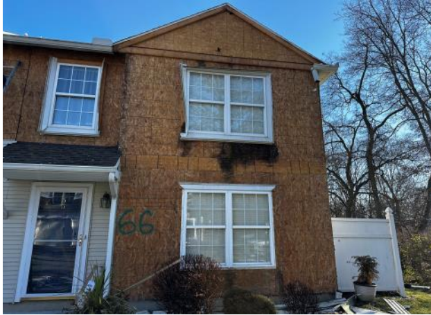
Photo #85: Overview of existing sheathing in poor condition below an upper window at Unit 66.