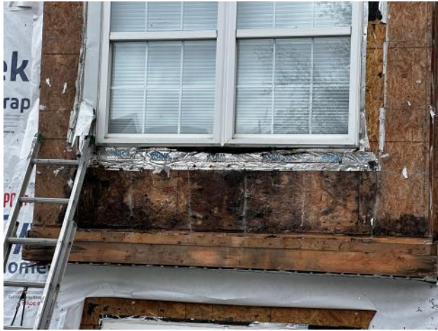
Photo #37: Overview of existing sheathing in poor condition after stucco was removed at the box window of Unit 68.