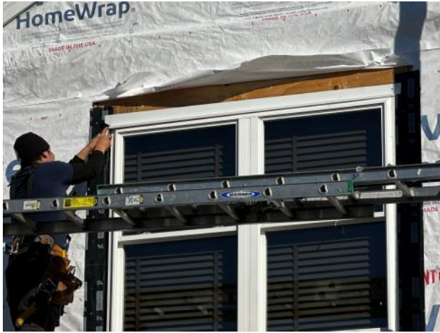
Photo #81: Overview of new flashing tape and metal drip cap being installed at a window.