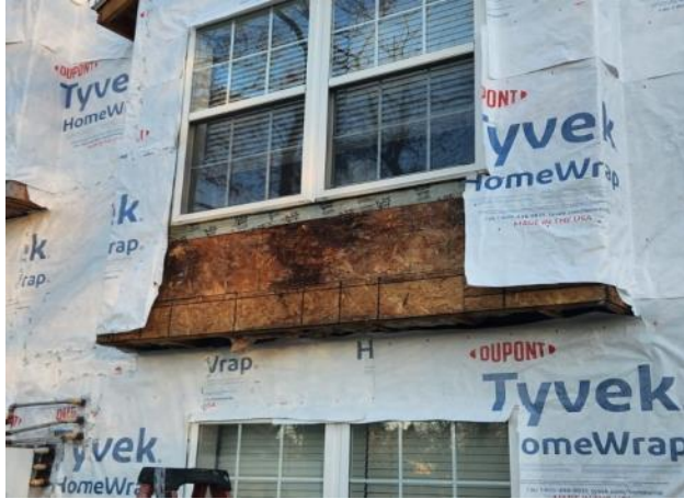
Photo #89: Overview of existing sheathing in poor condition below a box window at Unit 60.