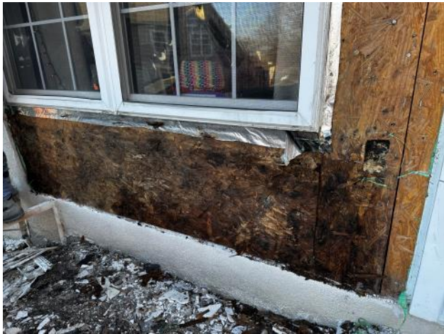
Photo #63: Overview of damaged sheathing below a window at Unit 26.