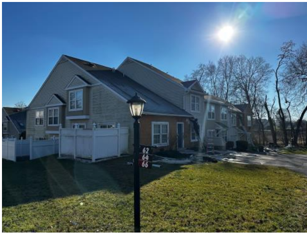
Photo #83: Overview of Lemus Siding Crew (Blue) working at Building 6 (56-66 Courtyard Drive).