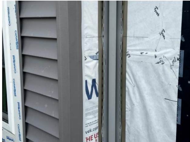
Photo #25: Overview of new metal flashing and vinyl corner installed.