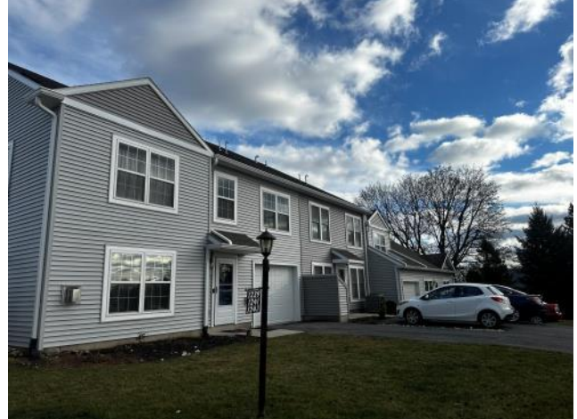
Photo #4: Overview of new gutters and downspouts installed at a front section of Building 10 .