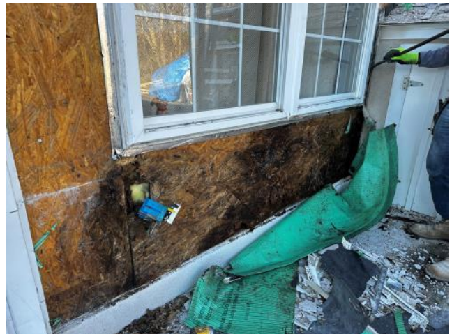
Photo #64: Overview of damaged sheathing below another window at Unit 26.