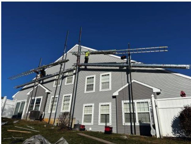
Photo #19: Overview of new vinyl siding installed at a main side of the Building.