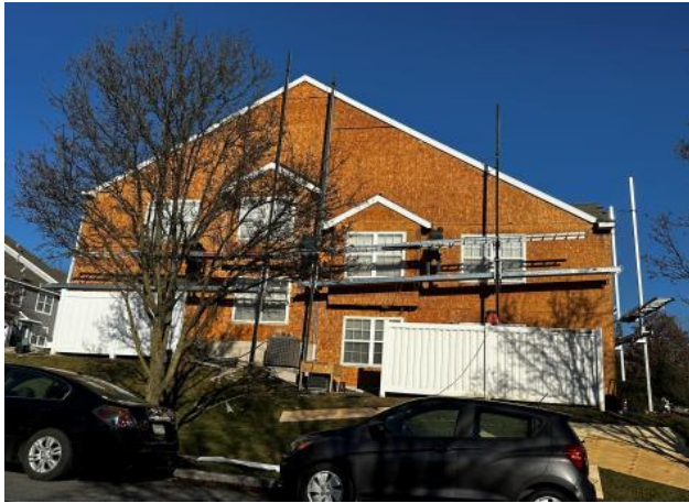
Photo #97: Overview of existing siding being removed at a main side section of the Building. No water resistant Barrier was observed.