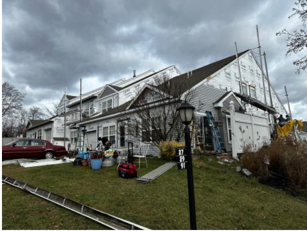
Photo #21: Overview of Lemus Siding Crew (Green) working at Building 12 (81-91 Courtyard Drive)